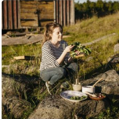
Slow Food Finland — VisitFinland.com Long before the rise of the global Slow Food ...