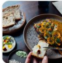
Slow Food Finland — VisitFinland.com Long before the rise of the global Slow Food Movement in the 80s, Finns were promoting the importance of ... visitfinland.com