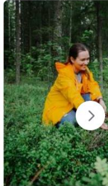
Slow Food Finland — Vi Long before the rise of the c