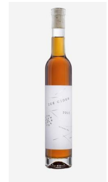
KUURA ICE CIDER 2015