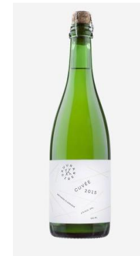
KUURA CUVÉE 2015