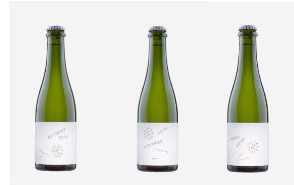
KUURA SIIDERI 2016

Handcrafted cider made from locally sourced Finnish apples; real cider, bubble cider, ice cider.